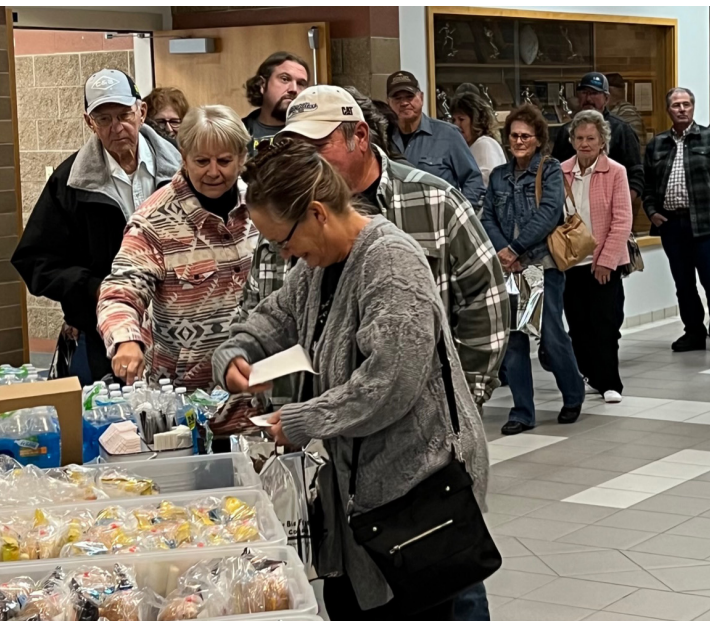
Lunch was provided to members after the Annual Meeting. | BIG FLAT ELECTRIC PHOTO